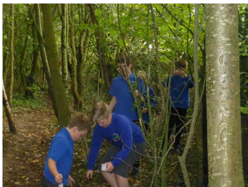
Year 6 Bug Hunting in the woods!

Year 4 Persuasive Letter Writing – In their English topic Year 4 have been thinking about ways to improve the school environment. As part of this they decided to write letters to me. I was very impressed with all their ideas and have asked them to move forward with some of their ideas in my reply.