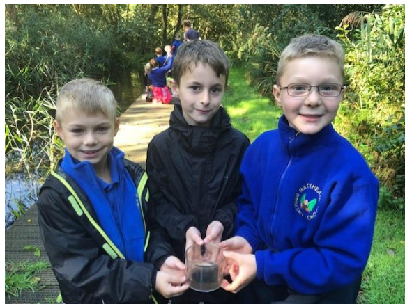
Report by Lennon Baker

In a short while it was lunch time. Then we played a food chain game about birds and when the game was finished, we got on the big bus in the car park. It was an amazing day!